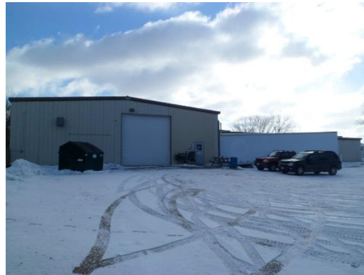
Service Entry 14x14 OH door