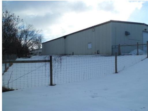
Rear-North Side with mesh fence