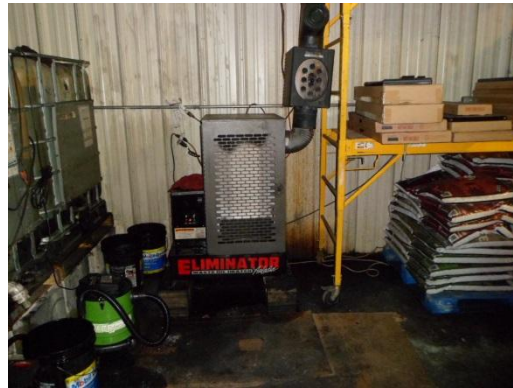
Oil Furnace-Service Area